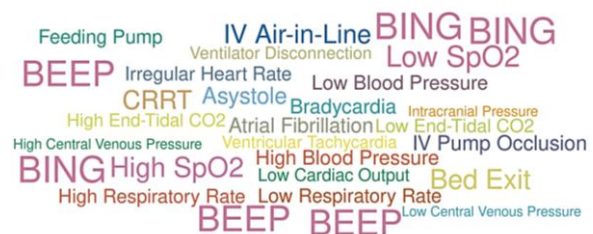
THE CACOPHONY OF ALARMS IN THE ICU