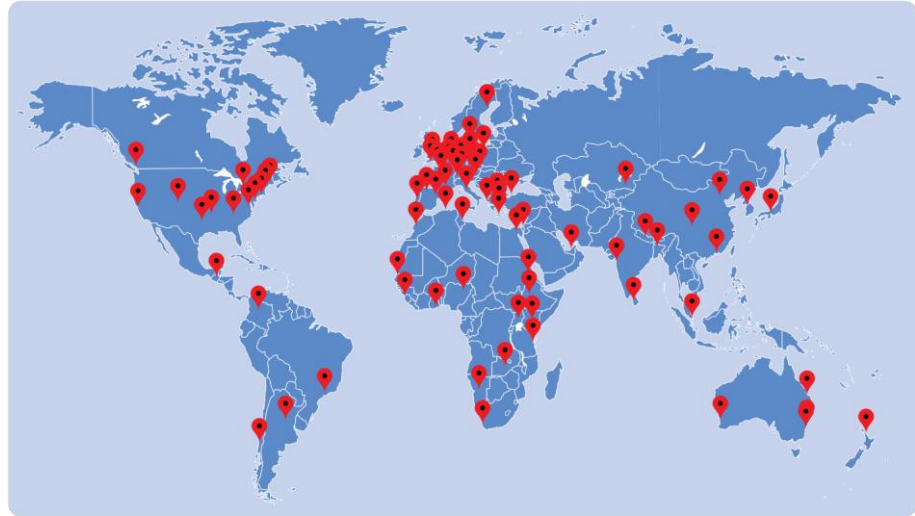
Fig 1 | Geographical distribution of the multidisciplinary experts